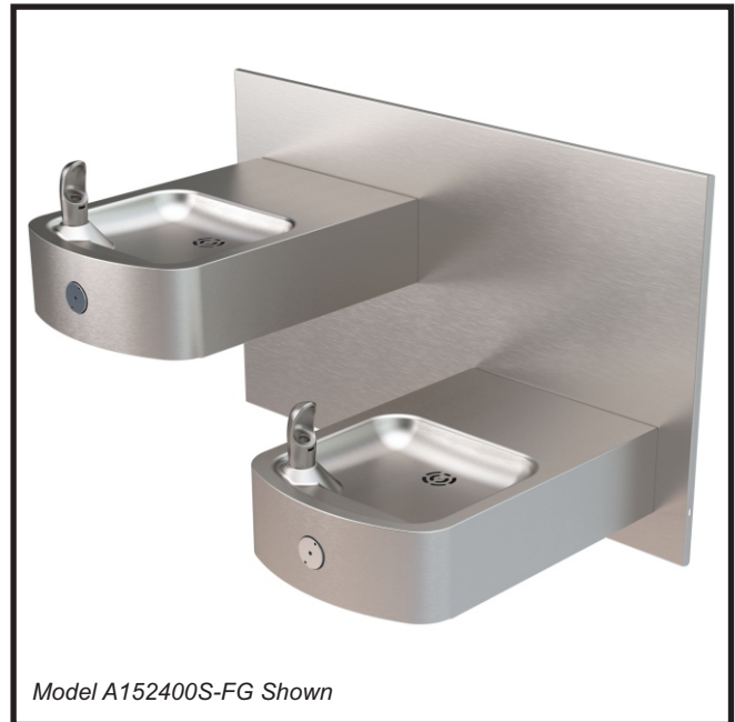
Model A152400S-FG Shown