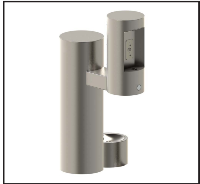
Model GYU64-PF Shown

Barrier-free bottle filler shall be Murdock model GYU64. Construction shall be 12 gage. Pedestal base shall have four mounting holes. Access covers shall be secured with vandal-resistant stainless steel screws. Bottle filler shall be activated by a 9 volt sensor or a pushbutton as standard. Unit shall contain a 100 mesh inlet strainer, lead and cyst filter, 6-AA battery pack and laminar flow spout. Self-closing pushbutton, needing less than 5 pounds force, shall activate internally mounted valve with adjustable stream regulator. Unit is certified to ANSI A117.1, Public Law 111-380 (NO-LEAD), CHSC 116875 and NSF/ANSI 61, Section 9. Fixture meets ADA requirements when mounted appropriately.