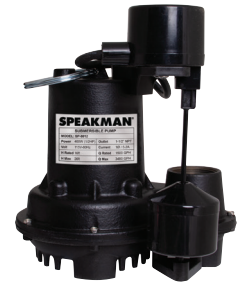
SP-8012 - 1/2 HP

Speakman is known for reliable innovations in safety, performance showering, and commercial grade fixtures. That same performance and quality is now available to protect single-family homes from water damage with our RESIDENTIAL SUMP PUMP . Boasting a robust cast metal body and backed by the performance of our 1/2 horsepower continuous-duty operation motor. Install with confidence knowing single family residential home are backed by the protection of Speakman.