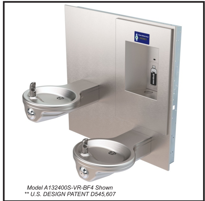
Model A132400S-VR-BF4 Shown ** U.S. DESIGN PATENT D545,607

Model A132400S-VR-BF4 is a Vandal Resistant, Wall Mounted, Bi-Level Drinking Fountain and Bottle Filler combination made from 18 gauge, 304 stainless steel with a brushed finish. Unit shall be activated by Chrome Plated Brass Pushbutton using less than 5 pounds of force. Bottle filler activates using an infrared sensor. Bubblers shall be polished stainless steel with non-squirt features and operate on a water pressure range of 20-105 psig. Unit shall have uniquely designed, two-piece contoured bowls with P-traps integral to the unit. Fountain is certified to ANSI A117.1, NSF/ANSI 61, Section 9, Public Law 111-380 (NO-LEAD), and CHSC 116875. Fixture meets ADA, ADA Standing Person, and ADA Child requirements when mounted appropriately.