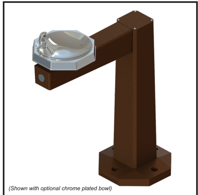
(Shown with optional chrome plated bowl)

All solid brass castings shall conform to ASTM standards B61 and B62. Unit is certified to ANSI A117.1, Public Law 111-380 (NO-LEAD), CHSC 116875 and NSF/ANSI 61, Section 9.