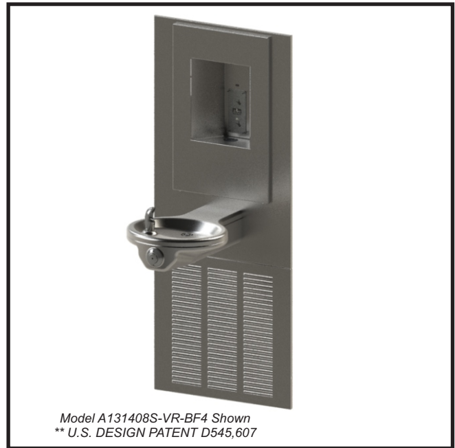
Model A131408S-VR-BF4 Shown ** U.S. DESIGN PATENT D545,607

Model A131408S-VR-BF4 is a Vandal Resistant, Wall Mounted, pressurized Chilled Drinking Fountain and Bottle Filler combination that shall deliver a minimum of 8.0 GPH (30.3 LPH) of water at 50°F (10°C) cooled from 80°F (26.7°C) inlet water and 90°F (32.2°C) ambient. Unit shall be activated by Chrome Plated Brass Pushbutton using less than 5 pounds of force. Bottle filler activates using an infrared sensor. Cooling system shall use R-134a refrigerant and be capillary tube regulated. An adjustable thermostat with an off position shall regulate the refrigeration system. Bubbler shall be polished stainless steel with non-squirt features and operate on a water pressure range of 20-105 psig. Unit shall have uniquely designed, two-piece contoured bowl with a p-trap integral to the unit. Chiller shall be listed by Underwriters Laboratories for both the US and Canada and is compliant to the Air Conditioning and Refrigeration Institute Standard 1010. Fountain and Chiller are certified to ANSI A117.1, NSF/ANSI 61, Section 9, Public Law 111-380 (NO-LEAD), and CHSC 116875. Fixture meets ADA, ADA Standing Person, and ADA Child requirements when mounted appropriately.