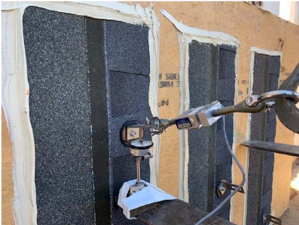
Photo No. 1 Pullout Test