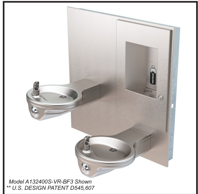
Model A132400S-VR-BF3 Shown ** U.S. DESIGN PATENT D545,607