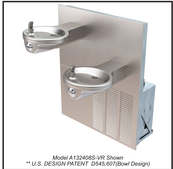
Model A132408S-VR Shown ** U.S. DESIGN PATENT D545,607 (Bowl Design)