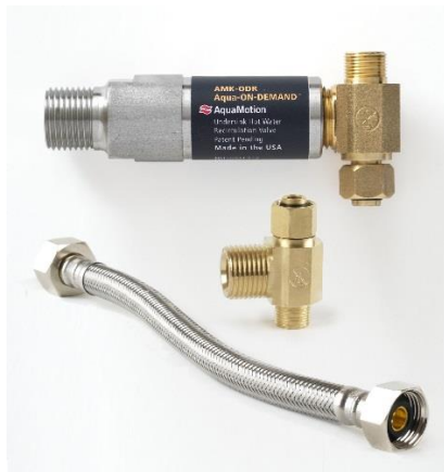
Components for Under Sink Installation