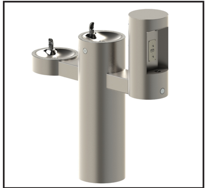
Model GYV34 Shown

Barrier-free drinking fountains with bottle filler shall be Murdock model GYV34. Construction shall be 12 gage, all stainless steel with 18 gage stainless steel fountain bowls. Pedestal base shall have four mounting holes. Access covers shall be secured with vandal-resistant stainless steel screws. Bottle filler shall be activated by a 9-volt sensor or a pushbutton as standard and provide 1.0 GPM flow. Unit shall contain a 100-mesh inlet strainer, lead and cyst filter, 6-AA battery pack and laminar flow spout. Self-closing pushbutton, needing less than 5 pounds of force, shall activate internally mounted valves with adjustable stream regulators. Bubblers shall be stainless steel with non-squirt feature and operate on water pressure range of 20-105 PSIG. Fountain is certified to ANSI A117.1, Public Law 111-380 (NO-LEAD), CHSC 116875 and NSF/ANSI 61, Section 9. Fixture meets ADA requirements when mounted appropriately.