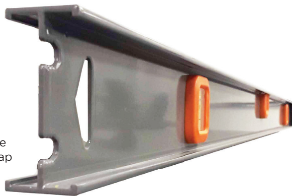
I-Beam Profile without end cap