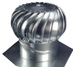
GEB-12 & GT-12 (shown) GALVANIZED STEEL TURBINE † ADJUSTS TO 7/12 ROOF PITCH AVAILABLE IN MILL ONLY