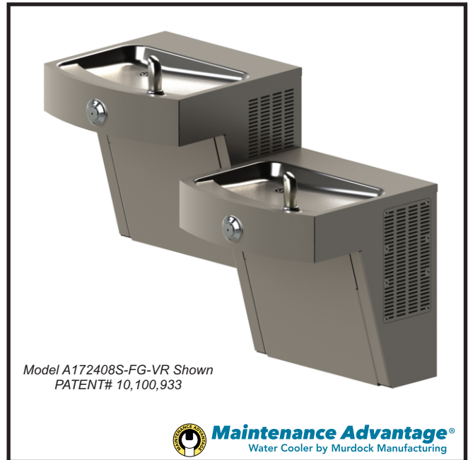
Model A172408S-FG-VR Shown PATENT# 10,100,933

Complies with the following standards: CHSC 116875 Test rating conditions are compliant with ARI 1010.