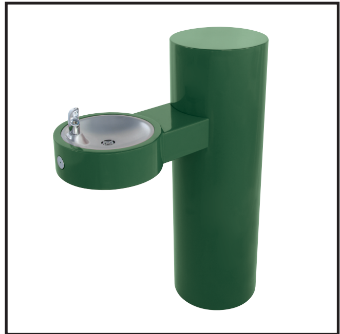
Model GRJ85-PF Shown

2 This option is not available freeze-resistant.