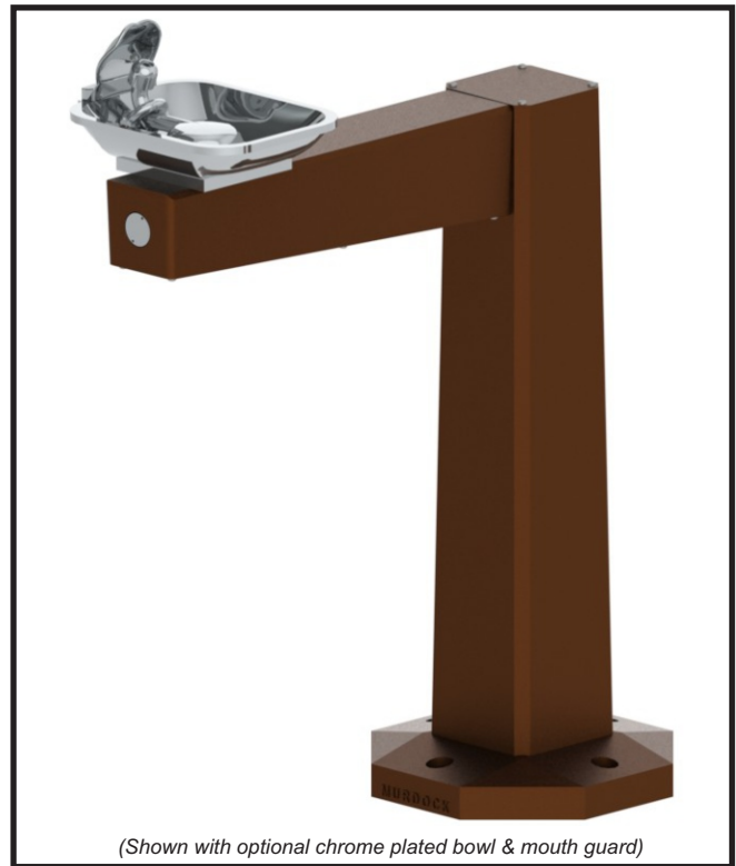
(Shown with optional chrome plated bowl & mouth guard)

All solid brass castings shall conform to ASTM standards B61 and B62. Unit is certified to ANSI A117.1, Public Law 111-380 (NO-LEAD), CHSC 116875 and NSF/ANSI 61, Section 9.